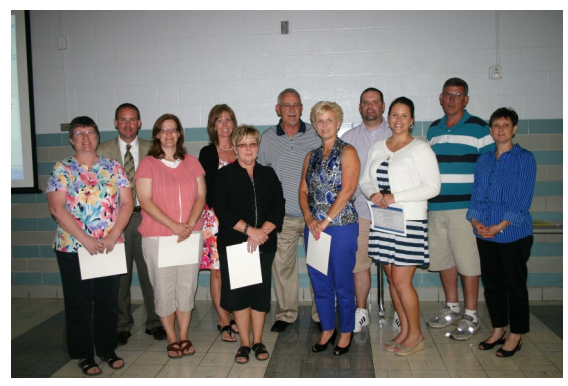
Harrison Hills Accreditation Committee

"I think it's very well deserved and nice to be recognized for efforts our professional team put in on a daily basis, and I appreciate the support of